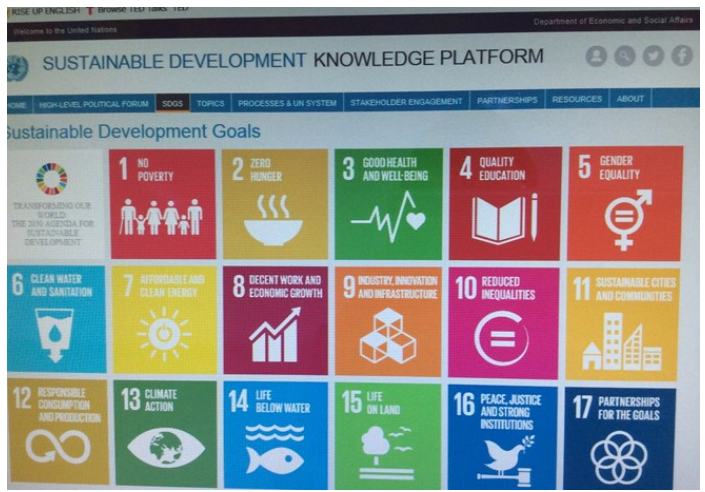
↑ United Nations homepage